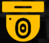
CCTV surveillance of all Facility for security