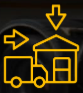
3PL Warehousing & OEM Delivery