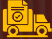
POD Proof of Delivery