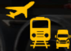
Multimodal Transport At in Services