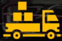
Night Owl Late Pick Up & Deliveries