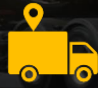
GPS Enabled Vehicle