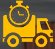
Time Bound Deliveries