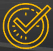
Realtime Tracking of Consignments