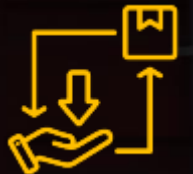
Delivery on Demand And Appointment